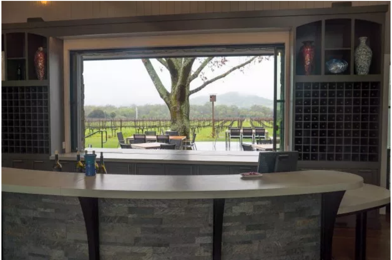
The view from inside St. Helena's new Goosecross Cellars winery overlooks the patio and estate vineyards.

The vibe: Surrounded by vineyards, the new pastoral gray barns blend seamlessly into the landscape. One barn serves as the tasting room, which opened in October, with an eye-catching bar with a crushed granite facade. It's easy to linger on the expansive patio, watching birds soar over the vineyards.