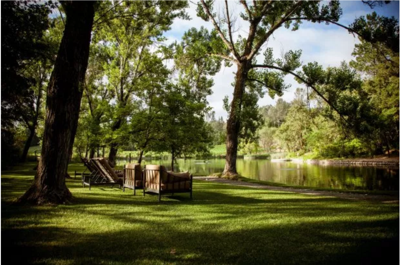
At Sinegal Estate in St. Helena, you can stroll the grounds and sip wine by the lake.